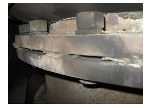
Fig. 2 View of a blown out seal in the connection of the boiler with the exhaust collector of a utilization thermal-oil boiler

In the case of an inappropriate boiler servicing, explosions and fire can take place in the boiler working areas on the heat exchange surfaces. They are favoured by more pronounced soot depositions on the heated surfaces. Such situations may especially arise during uncontrolled overloading of diesel fuels cooperating with utilization boilers, faulty exhaust blow or lack of heat reception from exhaust gases [3]. An example of destruction of a connection between a boiler and a collector of exhaust outlet throughout blowing out a seal as a result of fire and an explosion inside the boiler and as a consequence in the vicinity of boiler mounting is shown in Fig. 2.