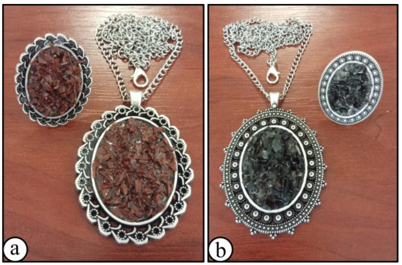
Fig. 3 a) Brown and b) Black colored, from obsidian fragments belonging to Nemrut volcanics, jewelry (necklace and ring) produced using epoxy binder material

In the study, the reason for using epoxy as a binding material; In addition to having high durability (heat, adhesive strength and chemical resistance), it is transparent (does not give any color), easy to work with and does not cause any unwanted curing and matting during drying. During the application, the broken parts of the obsidian were not completely covered with epoxy, the adhesive property of epoxy was used, because of taking care not to lose the shine caused by the special fractured structure of the obsidian. The epoxy and hardener used were mixed at a ratio of 2:1 and applied. The obsidian belonging to the Nemrut volcanics used in the study contains two different (brown and black) colors, jewelry was applied by using obsidian fragments of both colors (Figure 3).