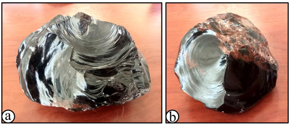
Fig. 2 a; b) Obsidian belonging to the Nemrut volcanics used in the study and showing conchoidal (mussel shell) fracture

and piercing tools (in the field of surgery) in the past ancient [6]. In addition to the making of sharp tools (arrowheads, spearheads, etc.), it has also been used extensively in the making of artistic objects and jewellery [7].