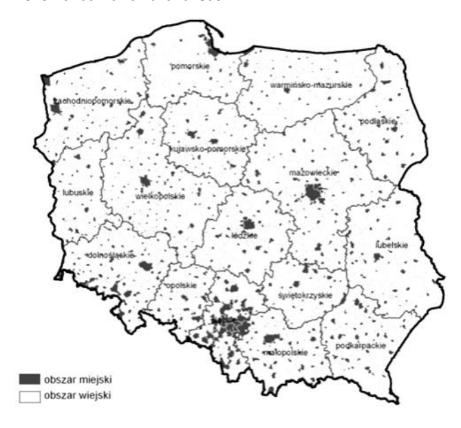
Fig. 3 Poland division to urban and rural areas Source: [10].

Poland is 312.7 thousand. km<sup>2</sup> big, which constitutes approximately 7.1% of the total surface area of the European Union (EU). It is divided into 16 provinces, 314 districts, 66 cities with the rights of districts and 2479 municipalities. The communes consist of auxiliary units, among others, village councils, of which there are more than 40000. The population in Poland is 38.5 million people, including 23.4 million in the cities and in rural areas - 15.1 million people. Rural areas in Poland constitute 93.1% of its territory, which is home to 39.2% of total population. The average population density is about 123.2 people per km<sup>2</sup>, while in the cities it is 1084.7 people per km<sup>2</sup> and in rural areas – 51.9 persons per km<sup>2</sup>. Polish countryside is characterized by a dispersed settlement network, which has approx. 52.5 thousand of rural localities, including 43 thousand villages [8]. The Figure 3, below shows the territorial division of the Polish urban and rural areas.